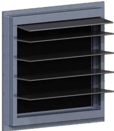
Weather Louvre NF302XXX

(Add for outside wall venting for weather protection)