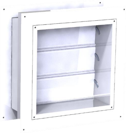
Inertech Vent NF301XXX

FSL Inert Clean Agent Gaseous Suppression Systems